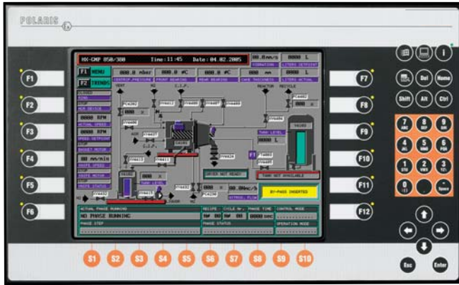
POLARIS Panel PC 10.4"